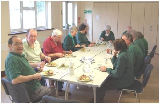
The 12 apostles (saints or sinners!) sit down to lunch – Judas is taking the picture!!